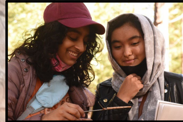
Assessing Annual Growth Rings