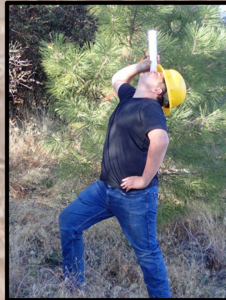
Measuring Canopy Cover