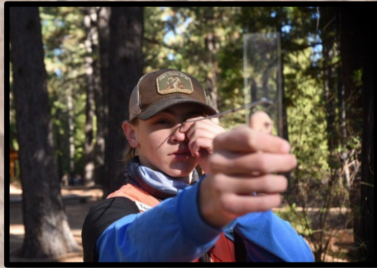
Determining Basal Area

Goal #1: Teach students the basic principles of forestry, connecting classroom math and science to hands-on experiences with real-world applications, enabling them to make recommendations about natural resource management.