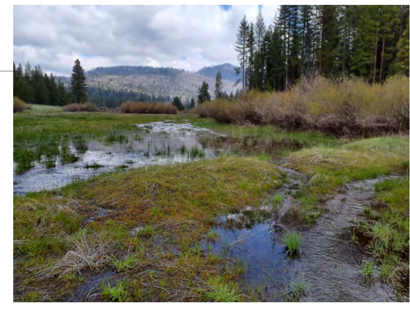
Water Flow Spring 2024